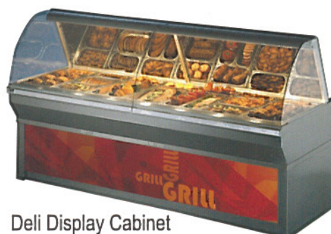
Deli Display Cabinet