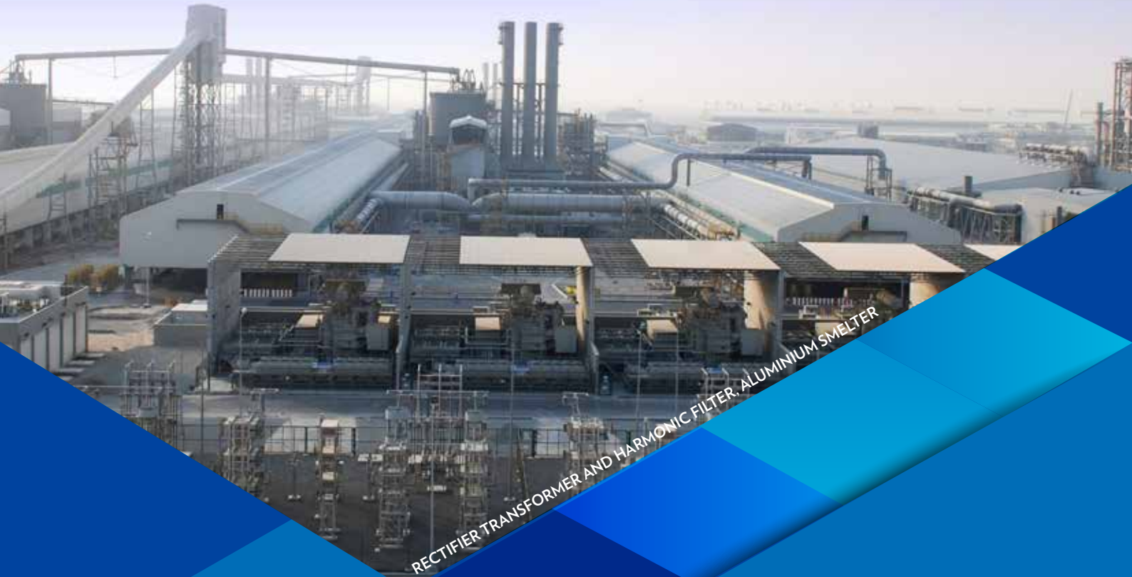
RECTIFIER TRANSFORMER AND HARMONIC FILTER ALUMINIUM SMELTER