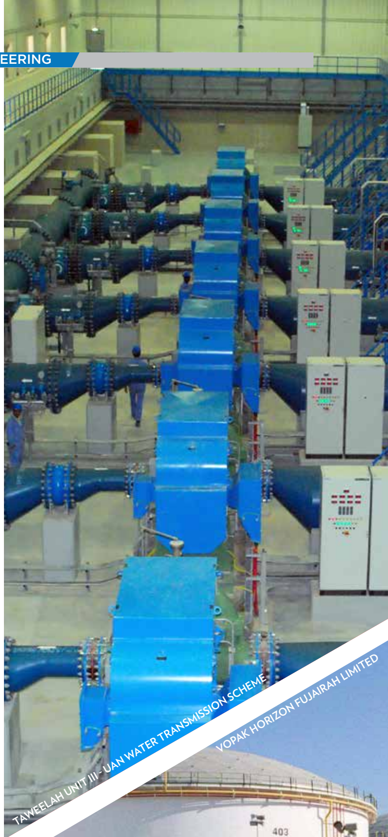
TAWEELAH UNIT III - JAW WATER TRANSMISSION SCHEME