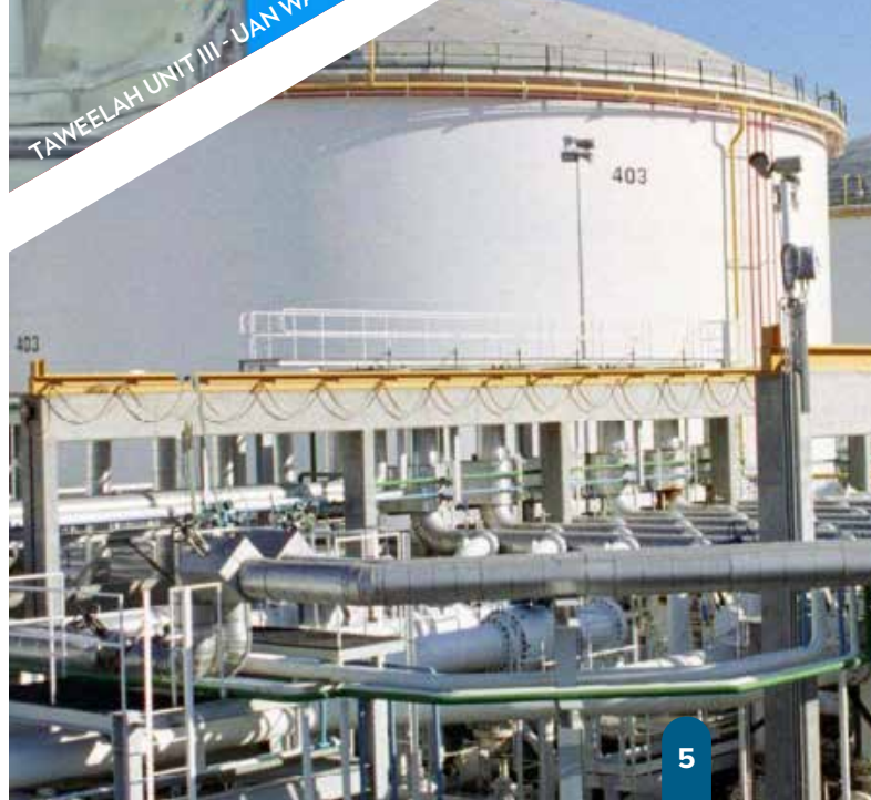
VOPAK HORIZON FUJAIRAH LIMITED