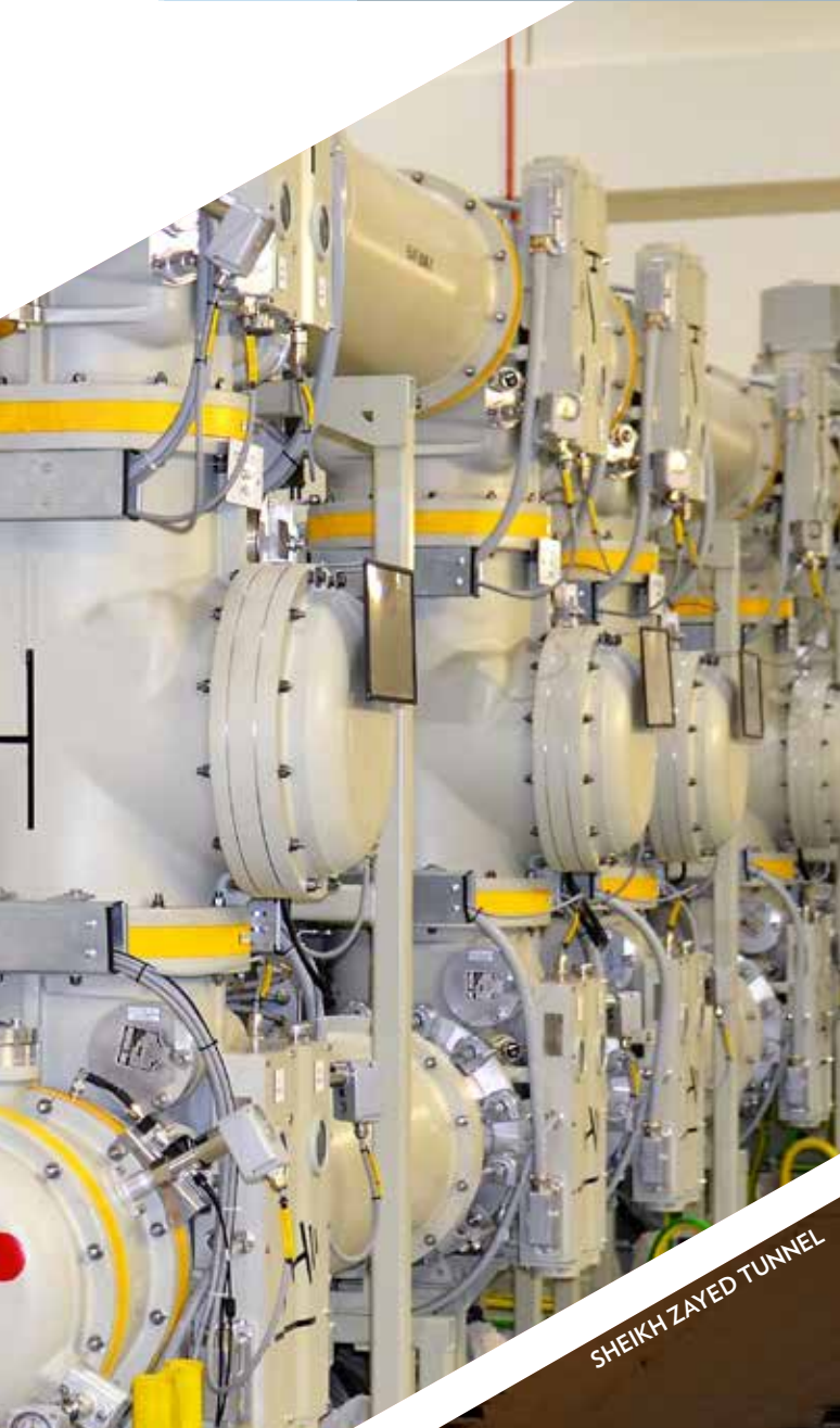
DEWA 132KV SUBSTATION